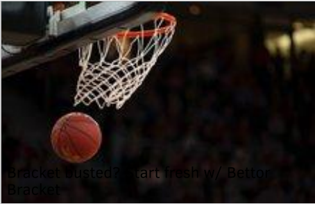
Bracket busted? Start fresh w/ Better Bracket