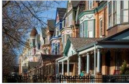
Top West Philly neighborhoods