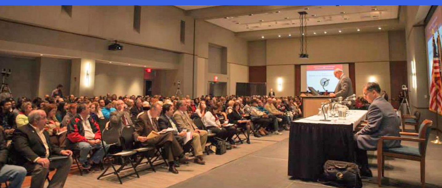
About 600 professionals and members of the public attend the ACA forum on November 14