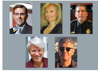
Hughes Center Steering Committee Updates Welcome to our new Steering Committee members