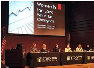
CLE Panel Discussion Center initiates continuing legal education