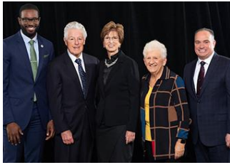
2019 Hughes Center Honors Read about the event, honorees, and presenters