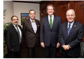
A Conversation with Don McGahn Former White House Counsel speaks at Hughes Center Event