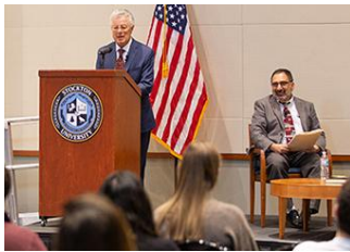
Gov. Florio visits Stockton Florio Urges Students to Stay Engaged and Informed