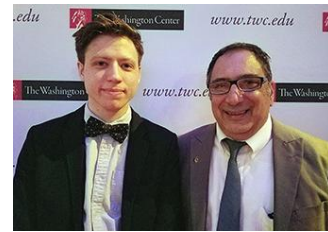
Civic Engagement The Hughes Center promotes civility and supports student engagement