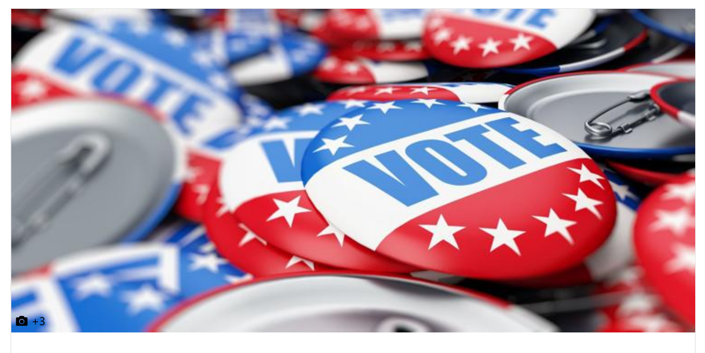
Where are local drop box locations for the upcoming election?

The Electoral College has representatives from each state, who are not members of Congress, who are appointed as electors. They cast their state's votes for president and vice president.