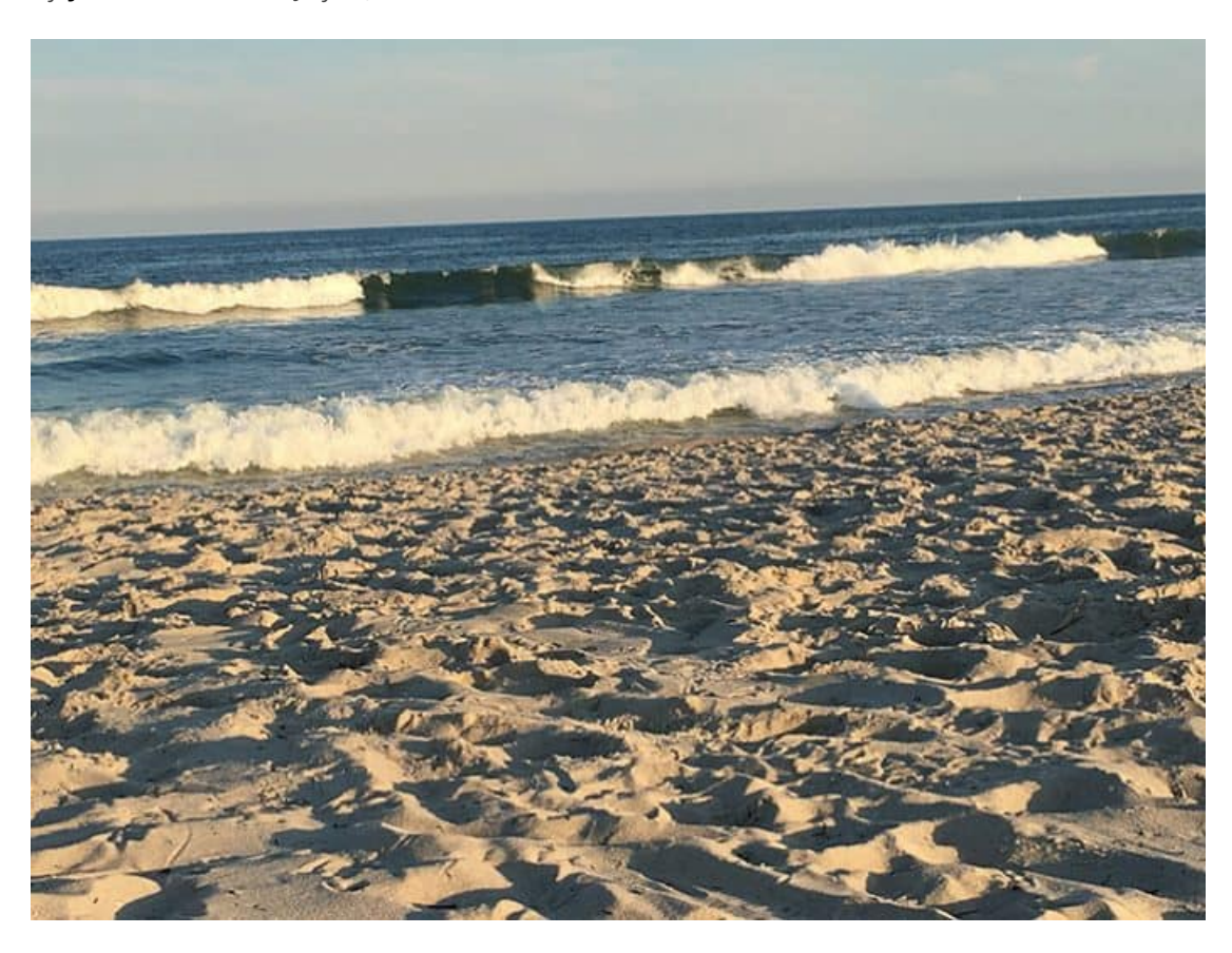
Beaches, like this one in Long Beach Island, are more likely to resist erosion than in previous years, officials said.

NEW JERSEY – There were delays due to weather and litigation, but the dune projects in Mantoloking are complete, or near complete, and the Army Corps of Engineers (USACE) will be in Ortley Beach by August, officials said.