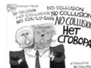
Nyet Collusion By: Pat Bagley