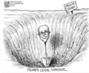
Rudy Giuliani