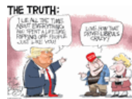
Liar's Club