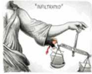
Justice Department Tampering