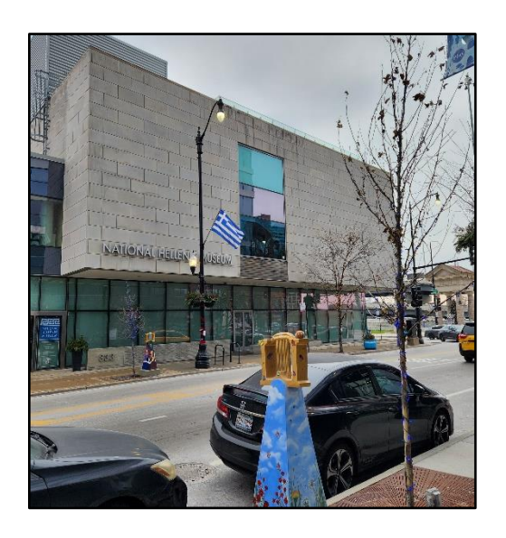
Left: National Hellenic Museum, Chicago. "Pharos" (lighthouse) installations along street.

Today, a new edifice is drawing attention to this part of town: The National Hellenic Museum . Walking down Halsted St., past Hellenic-themed pharos (lighthouse) installations lining the street (part of a community art project), I found myself immersed in Greek-American culture. Nowhere did I feel that more profoundly than after entering the National Hellenic Museum. The original location opened in 1983, but its current site which opened in 2011 has become the cornerstone of this iconic neighborhood.