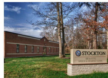
The SRI & ETTC facility located on 10 W. Jim Leeds Road in Galloway

The SRI&ETTC will customize technology, content, and instructional leadership PD to meet your needs!