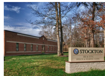
The SRI & ETTC facility located on 10 W. Jim Leeds Road in Galloway