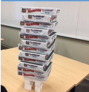
Dr. Boakes led a hands-on, math-based, building challenge with girls who built a stool completely out of folded cards that held more than 60lbs of weight!

Contact Dean Keenan to volunteer in any other way, too.