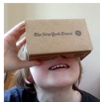
Augmented Reality for Everyone!

Apply online for a virtual field trip with Google Expeditions , no physical travel required.