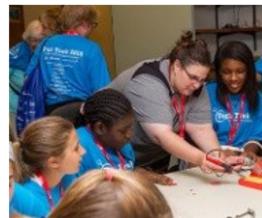
Volunteer today to lead or assist at a workshop or to network with middle school campers on STEM Women's Professional Night during Tech Trek Camp at Stockton, July 17-23, 2016.

The P. Buckley Moss Foundation invites grants for up to $1,000 to teachers who support a new or evolving program that integrates the arts into educational programming. The program establishes tools for using the arts in teaching children who learn differently. Apply May - September, 2016.