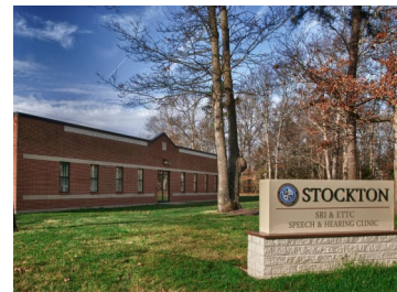
The SRI & ETTC facility located on 10 W. Jim Leeds Road in Galloway

Please see www.ettc.net for a full listing of workshops throughout the fall semester.