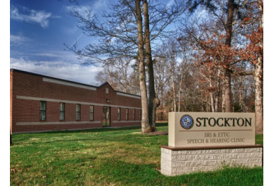
The SRI & ETTC facility located on 10 W. Jim Leeds Road in Galloway

Visit the SRI&ETTC calendar to learn about additional programs and events.