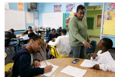
Evaluating Teachers with Classroom Observations: Lessons Learned in Four Districts is available for free download from the Brookings Institution.

Attend SGO 2.0 on June 11 or 12 at Stockton from 9-12 or 1-4 on either day. Registration is free online at the NJDOE web site .