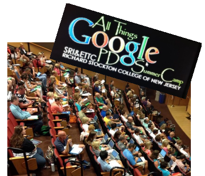
A fully-attended All Things Google Summer Camp in July

Remember to "Like" us on Facebook and get daily updates about workshops and classroom resources.