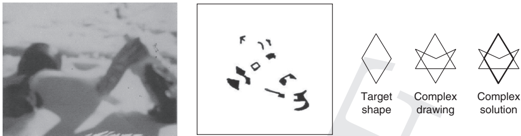
Figure 30.1 Kozbelt (2001) demonstrated that expert artists outperformed untrained novices in perceptual recognition tasks, such as identifying the objects depicted in blurry photos (left) and incomplete line drawings (middle), as well as detecting simple shapes embedded in complex collections of lines (right).

tasks was positively correlated; statistically controlling for performance on one or the other type of task suggested that artists' perceptual advantages are best viewed as a subset of their drawing skills. In sum, artists' perceptual advantages are real, and they are developed largely to the extent that they are useful in drawing. 1