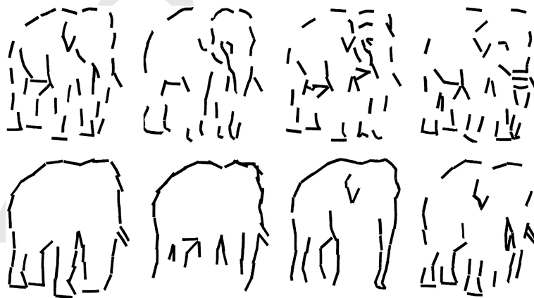
Figure 30.3 Some images of an elephant produced in the limited-line tracing task reported by Ostrofsky et al. (2012). The top row shows tracings produced by trained artists; the bottom row shows tracings produced by untrained novices.

Along similar lines, Perdreau and Cavanagh (2013) argued that artists' perceptual advantages arise from robust representations of object structure in memory, which can be used to encode and depict important aspects of objects (see also Kozbelt, 2001). Other evidence suggests skilled drawers are more efficient, not just more accurate, in perceptual processing of objects, compared to unskilled drawers. Perdreau and Cavanagh (2014) had artists and non-artists discriminate possible versus impossible figures