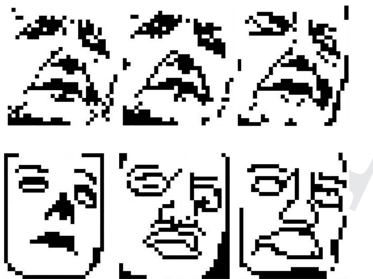
Figure 30.4 Some images of a face produced in the pixel drawing task reported by Kozbelt et al. (2014). The top row shows tracings produced by trained artists; the bottom row shows tracings produced by untrained novices.

(Cohen & Bennett, 1997; Ostrofsky et al., 2012). For instance, in one recent investigation (Kozbelt, Snodgrass, & Ostrofsky, 2014), artists and non-artists created depictions by placing 225 small squares of black tape within a 28 \times 32 grid superimposed on a photograph of a face. Superimposing a standardized grid on the reference image, where each square may be either black or white, allows for objective binary coding of each “pixel” within the depiction. Moreover, the reference image can be processed via image manipulation software to preserve the position, coarseness, and size of the grid, and the number of black versus white elements; this can then serve as the “best” pixelated drawing, at least in bottom-up terms. An analysis comparing square placement in each drawing with that of a computer-generated version of the image revealed a large artist advantage in sensitivity to placing the squares appropriately – a bottom-up index of drawing skill. Subjective accuracy ratings by artist and non-artist judges also indicated that artists’ ratings of other artists’ renderings were considerably higher than any of