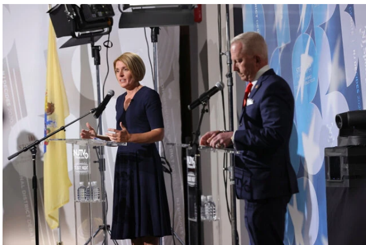
Amy Kennedy, left, and Representative Jeff Van Drew during a debate last week. Mr. Van Drew joined the Republican Party in December after voting against impeachment.

A campaign-style event in February featuring Mr. Trump in Wildwood, N.J., drew thousands of ardent fans, many of whom endured freezing temperatures as they waited in line for two days. On Labor Day weekend, supporters of the president gathered off the coast for a flotilla that participants estimated drew 2,400 boats.