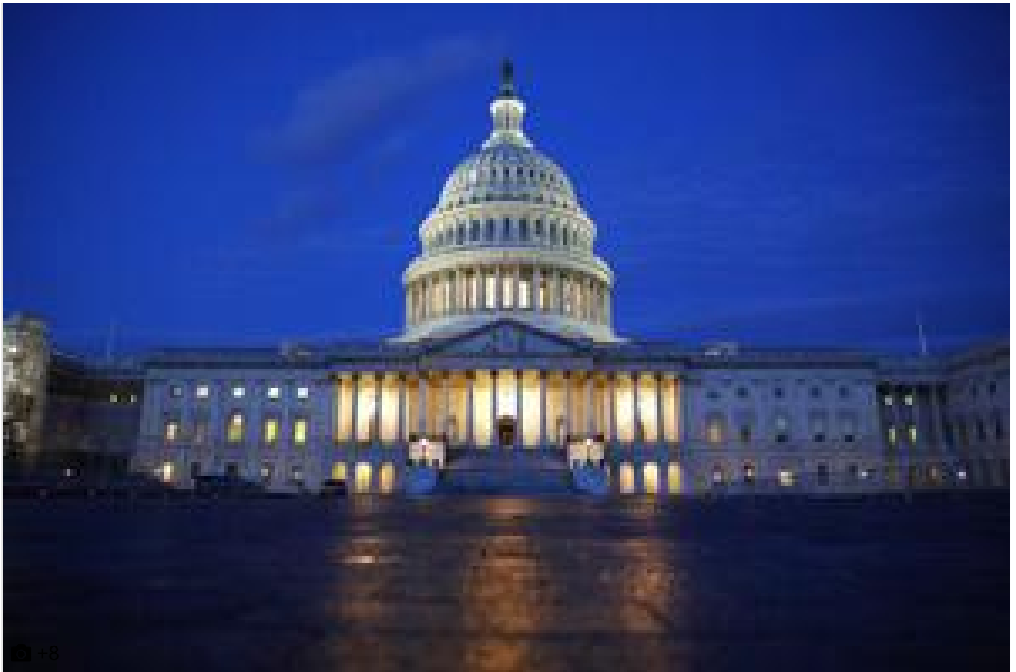
The latest on the 2nd District Congressional race