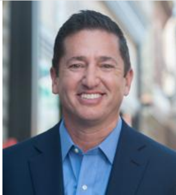
Richter exits 2nd District race, will run for Congress in 3rd