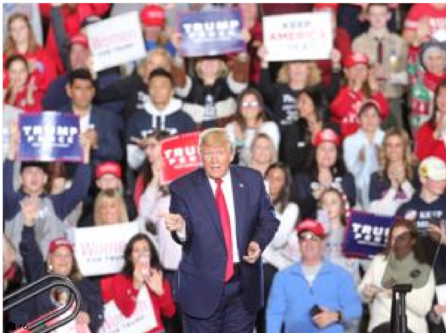
Trump praises Van Drew in Wildwood campaign rally

Democrats call on Trump, Van Drew to reimburse Wildwood for rally