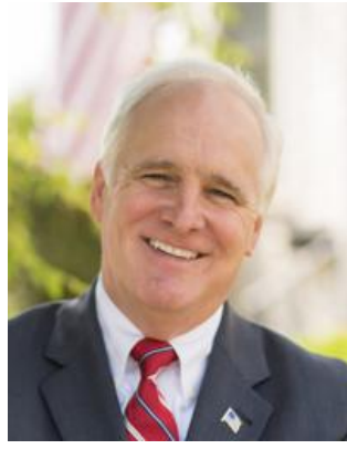
Last GOP challenger to Van Drew hits back on rally day