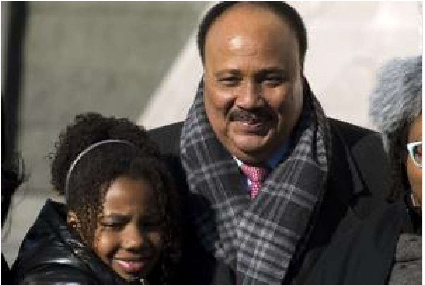
Martin Luther King III to visit Atlantic City school, Wildwood protest