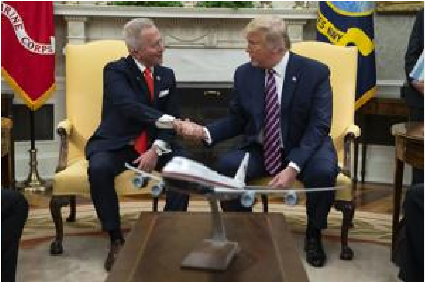
More than a rally: Wildwood Trump event cements Van Drew support